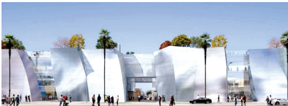
Proposed Rendering (View from South Santa Monica Boulevard)

Design elements include two pedestrian bridges over the alley and a below-grade tunnel connecting the Rodeo and Beverly portions. The project also includes permanent encroachments into the public right-of-way for parts of the