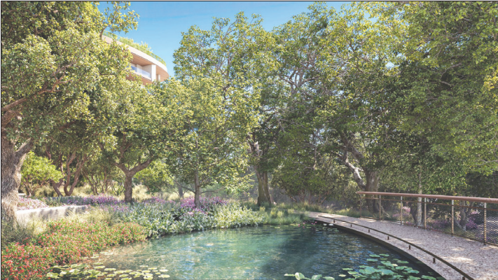
One Beverly Hills Gardens Pond

The gardens aim to transform Wilshire and Santa Monica Boulevards into green,