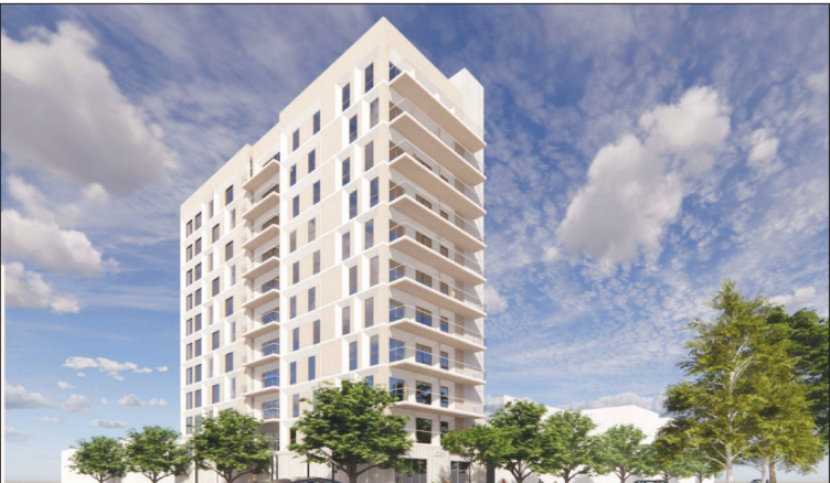
Project Rendering: Northwest Corner of N. Oakhurst Drive and Alden Drive

levels. The development would replace an existing eight-unit apartment building and a detached six-car garage built in 1947. The