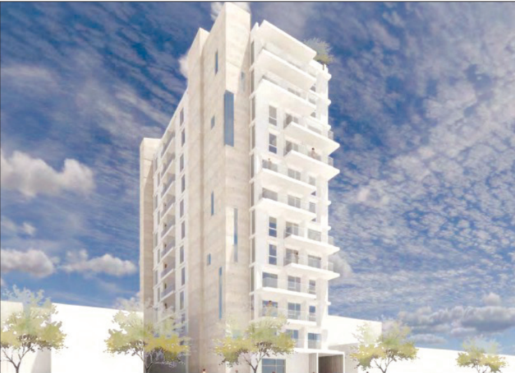
Project Rendering: Front Facing N. Maple Drive

The Beverly Hills Planning Commission is expected to consider two builders remedy projects, including a proposed 12-story, 65-unit residential development at 346 North Maple Drive, and an 11-story residential building at 401 North Oakhurst Drive, during its October 14 meeting.