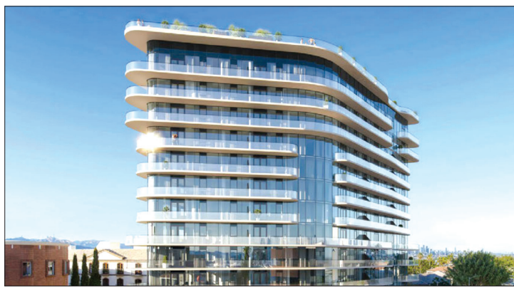
Project Rendering looking Northeast from Olympic Boulevard