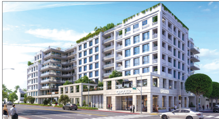
Project Rendering looking Northwest from Olympic Boulevard

The development would feature three levels of subterranean parking, accommodating 180 vehicles, and 21 of the residential units would be reserved for low-income households. Unit types would range from one- to three-bedroom apartments. Planned amenities include private and common outdoor spaces, such as balconies, a courtyard, a rooftop area, a gym, and a community room.