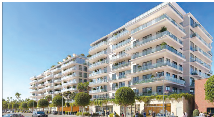
Project Rendering looking Southwest from South Beverly Drive

apartments across properties co-owned with Harkham Family Enterprises.