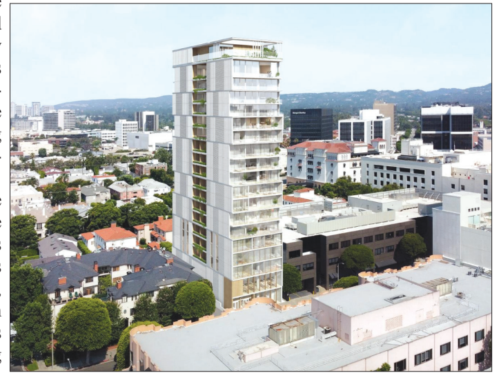
Project Rendering looking Northwest

pected to recuse herself from the discussion because she owns a building on the same block.