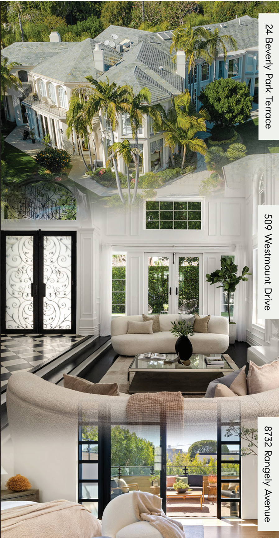
24 Beverly Park Terrace

in Total Sales Volume and Units Sold in 2025 for Compass West Hollywood