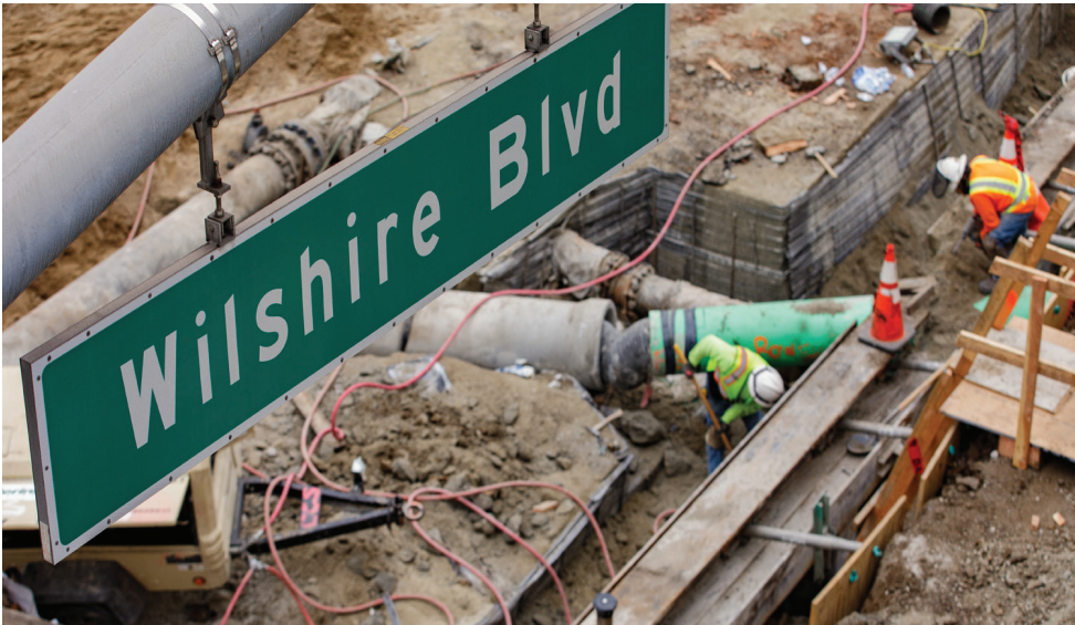
D LINE SUBWAY EXTENSION PROJECT Section 2 – Beverly Hills