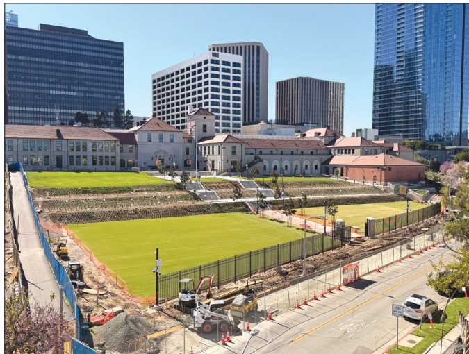
Drought Resistant Vegetation is at Center

Board members briefly considered whether to add more grass to landscaped areas, but district staff said doing so would require replacing the irrigation system and could add hundreds of thousands of dollars in costs. Changes could