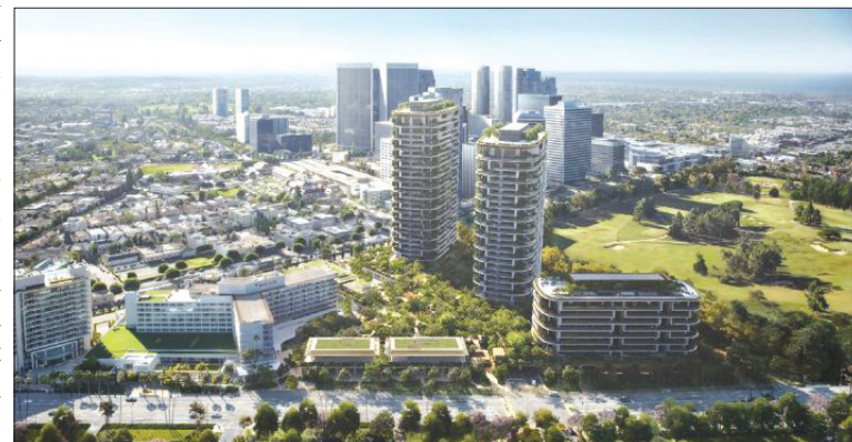
Rendering of One Beverly Hills

The funding package, led by J.P. Morgan with participation from VICI Prop-