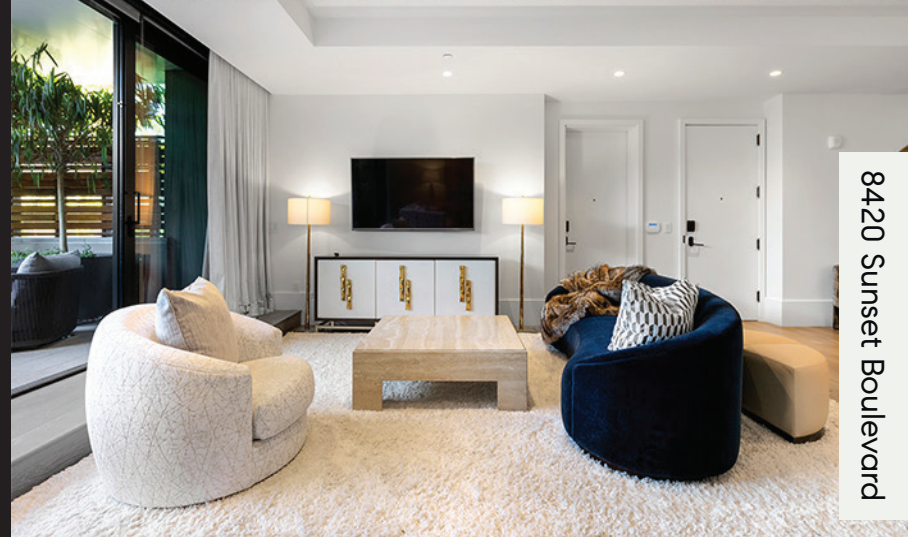
8420 Sunset Boulevard