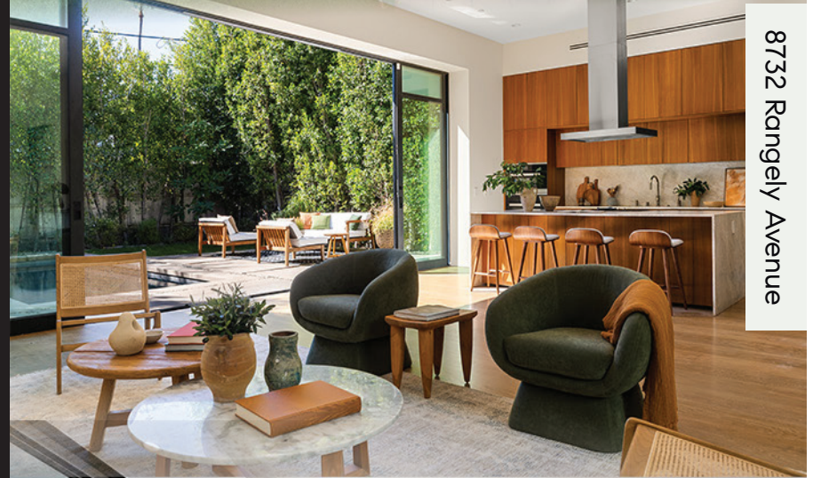
8732 Rangely Avenue