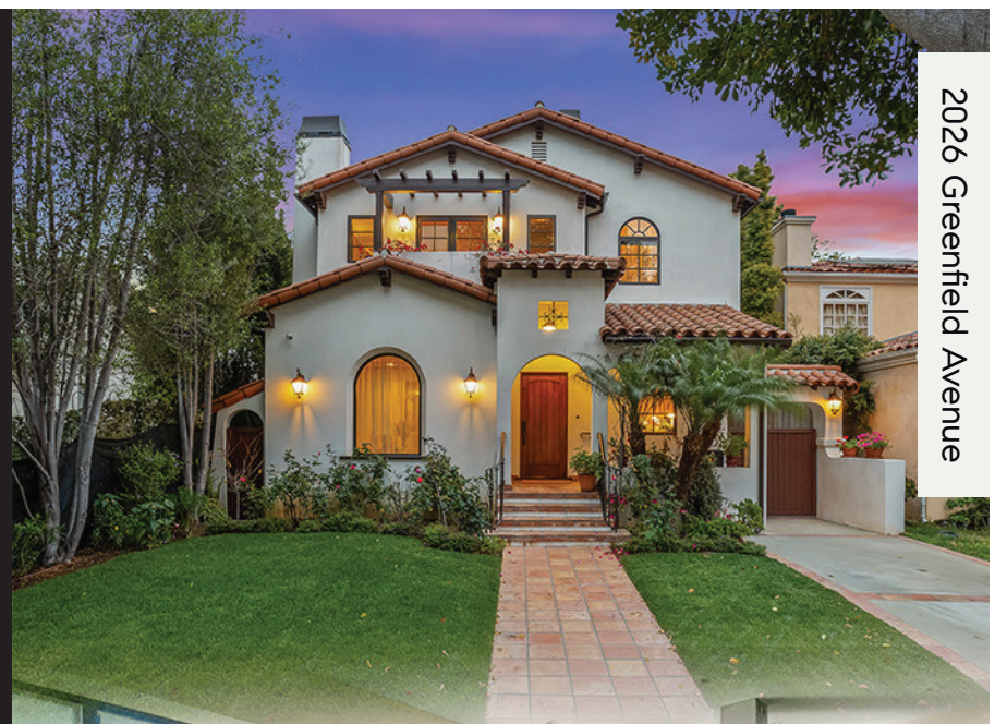
2026 Greenfield Avenue

Real Estate Agent in Q1 of 2026 for Compass West Hollywood