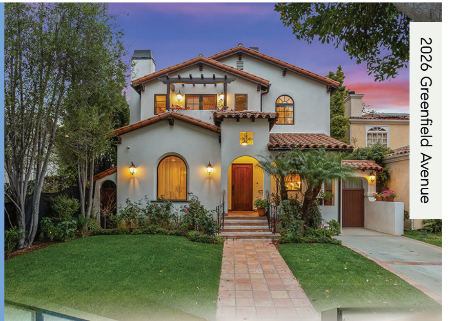
2026 Greenfield Avenue

Real Estate Agent in Q1 of 2026 for Compass West Hollywood