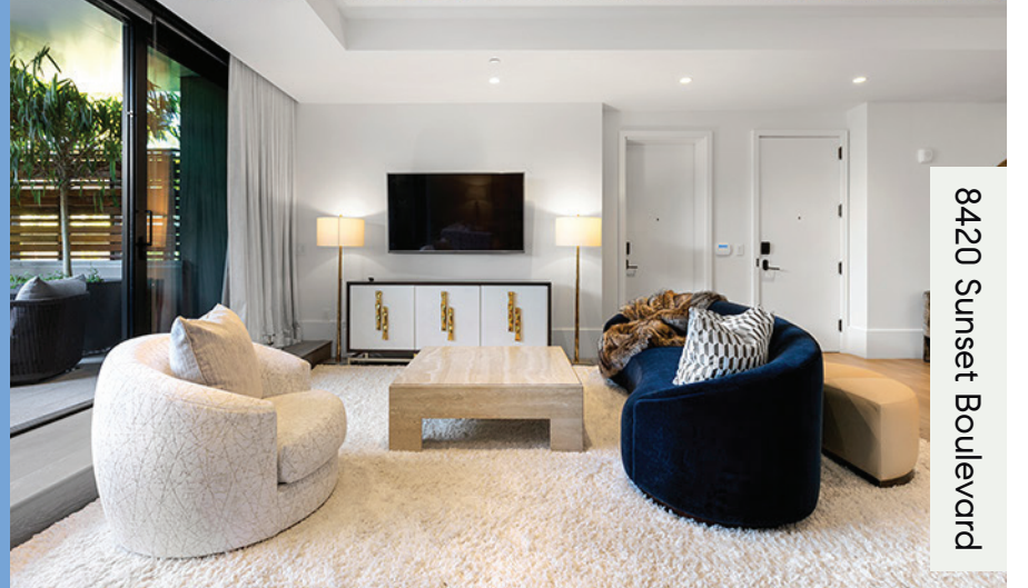
8420 Sunset Boulevard