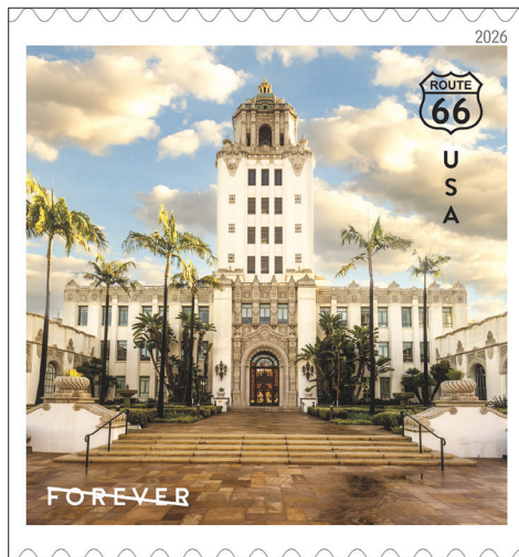
Beverly Hills City Hall Stamp

The Postal Service commemorated the centennial of Route 66 with the release of a set of eight stamps, each showing a site from the states through which the