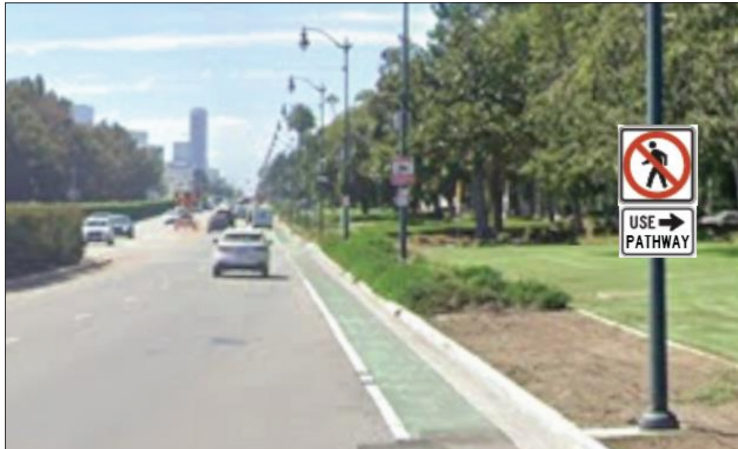
Example of Signage

The city is taking efforts to improve pedestrian and cyclist safety after the city received complaints regarding pedestrians walking within the bike lanes