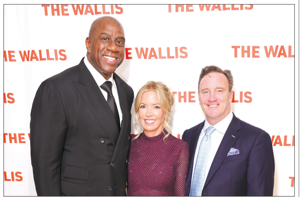
Magic Johnson, Jeanie Buss, Jay Mohr