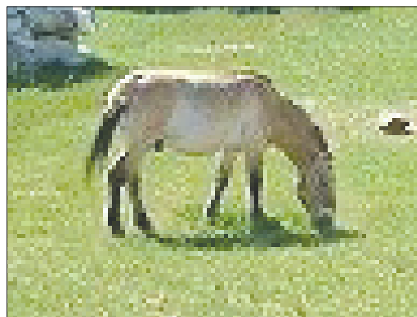
A Przewalski's horse

On our first day in Mongolia, we traveled by four wheel drive van from UB to the Husain Nuruu National Park. The exclusive means of ground transportation is in these vans over rocky unpaved tracks. We quickly got used to this but the Mongolians have a lot to learn from tourist oriented African countries such as South Af-