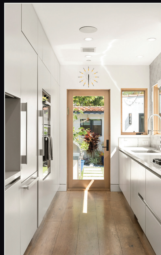
COMPASS MARKETING ADVANTAGE