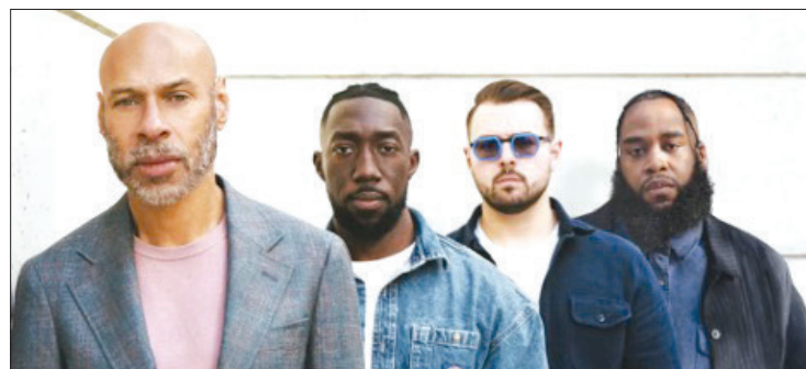
Joshua Redman Quartet

"While the title may sound ironic, this is anything but a step backward. It is an organic next chapter: a set of previously unheard original compositions brought to life by a new quartet, featuring pianist